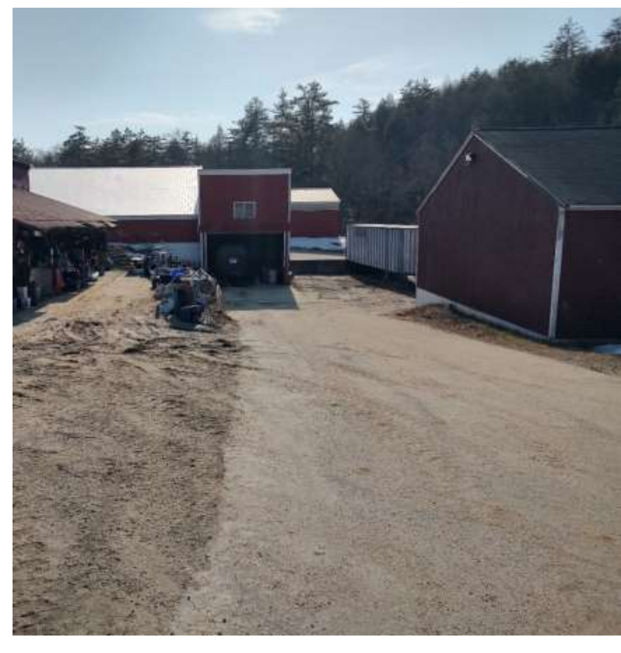
Exhibit C Concrete pad in front of and under Trash Compactor Box