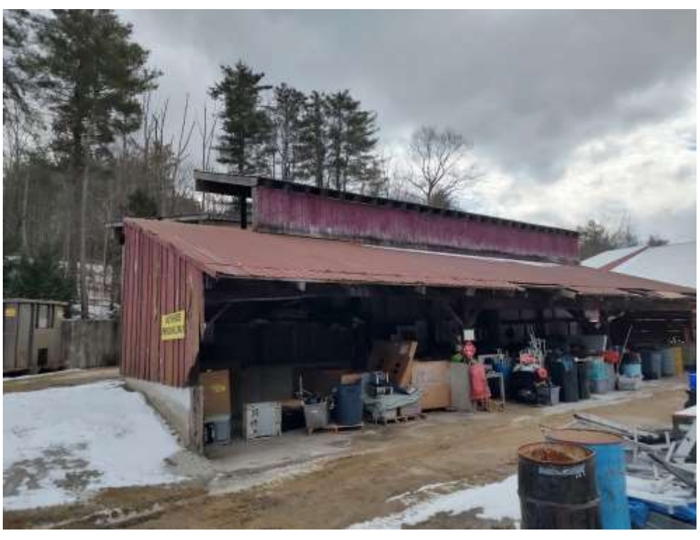
Exhibit B Exhibit B