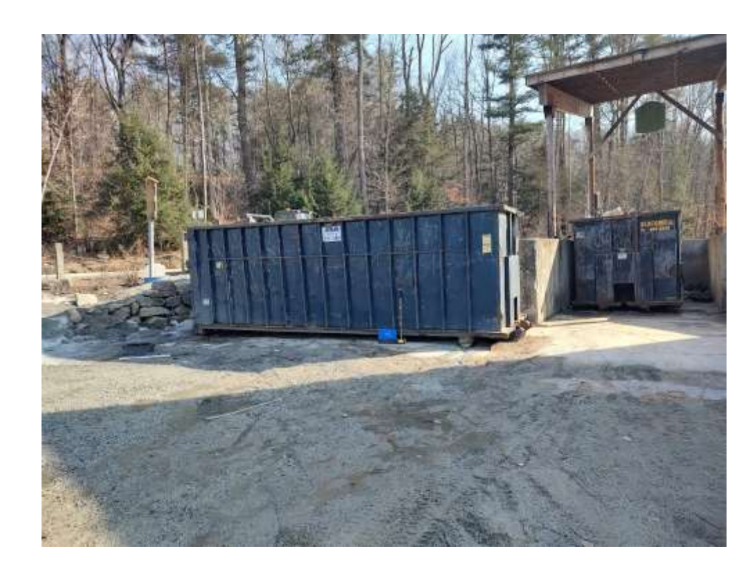
Exhibit D View of Demolition Overflow and Steel Recycling Box Exhibit 1-c.

(sections shaded in blue remain in place)