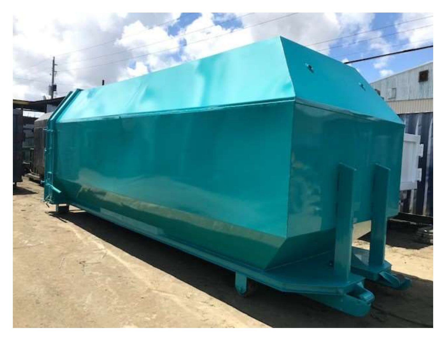
Note the steel wheels on the bottom of box. Industry standard, first point of contact with Concrete Pads, the major cause of our concrete damage, and why these aggressive repair specifications.