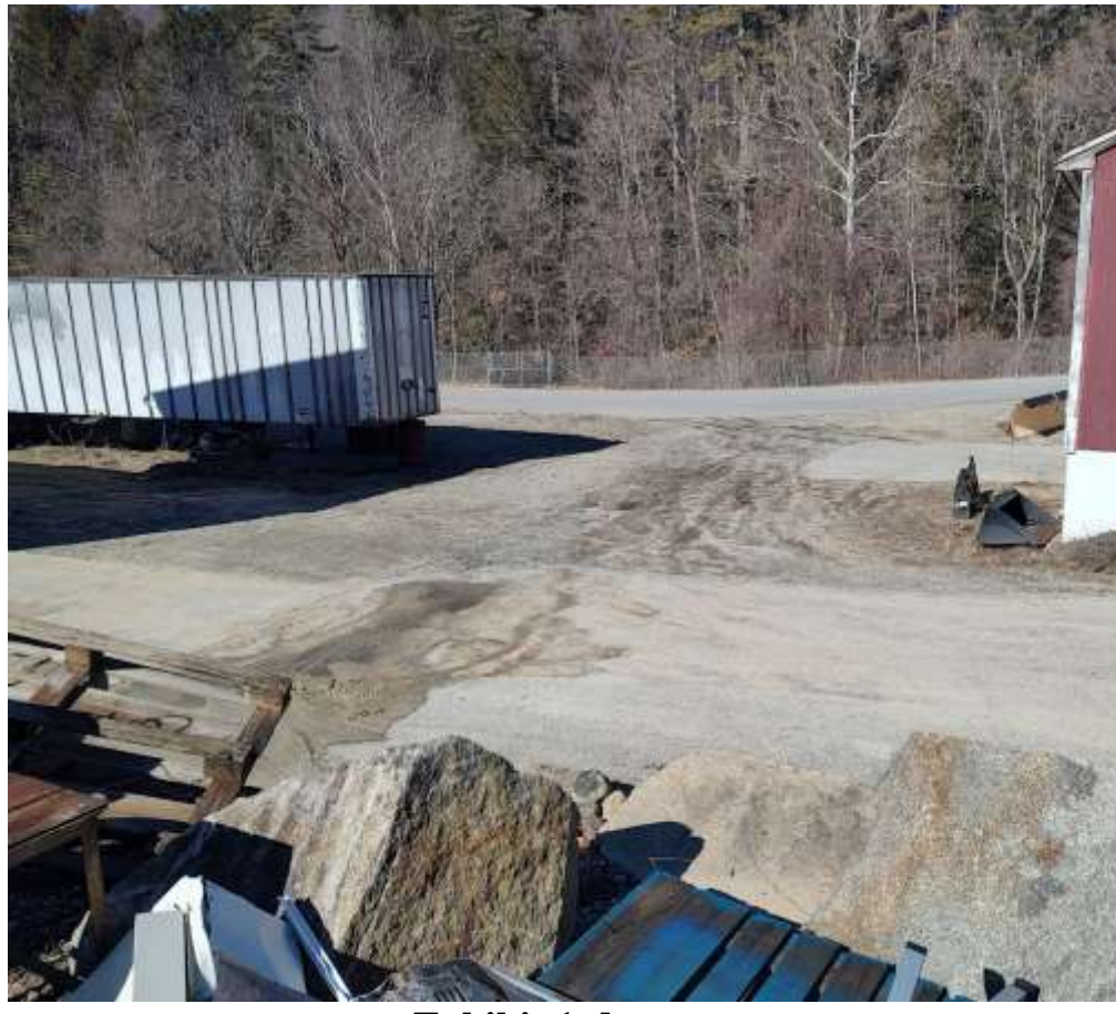
Exhibit 1-d New Asphalt connecting point 25' x 67' with turning flairs. This will include the 16' x 17' apron to building on right.

(view runoff water stain in direction of existing catch basin)