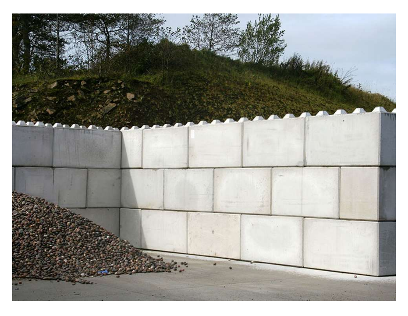
An example of Lego Style Concrete Block Retaining Wall W/O cap blocks