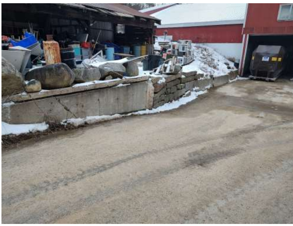
View of Exhibit A Existing Retaining Wall