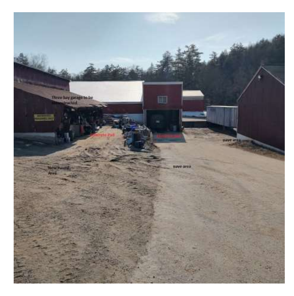
Exhibit 1-a. 106' x 17' asphalt driveway between Trash Compactor Concrete Pad and Residential Exit Road. To the left is Exhibit 1-b & 1-c