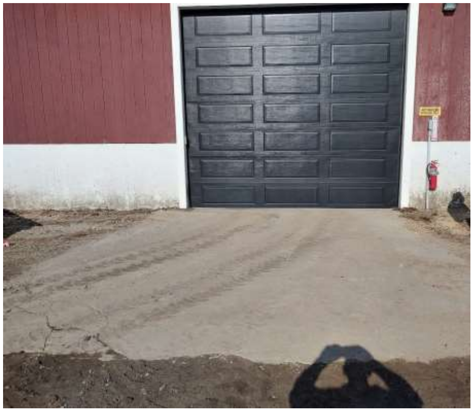
Exhibit D from afar and triangular Exhibit 1-c in forefront